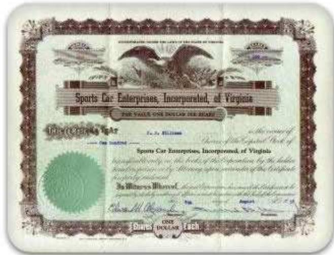
Sports Car Enterprises Stock Certificate

The old saying goes that automobile racing began just a couple of hours after the second car was built. In fact, the first automobile race took place in France in 1894, from Paris to Rouen, and the first American race took place the following year, a round-trip race between Chicago and Evanston, Ill.